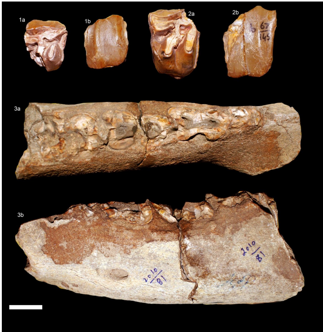
Fig. 3. Rhinoceros aff. R. sondaicus (Rhinocerotini, Rhinocerotidae, Mammalia). 1a-b, 67/145a, isolated rP2; 2a-b, 67/145b, isolated rP3; 3a-b, PUPC, 10/81, broken mandibular fragment having preserved roots of teeth from p2-m1; a-occlusal; b-lingual; c-labial, Scale bar equals 30 mm.

The IP4 in the present collection is closely comparable both in morphology and size to the IP4 (ANSP No.14630) described by Colbert (1943) from lower Pleistocene, Upper Siwaliks of Northern India. The crochet in P4 of the present collection is similar in appearance to ANSP 14630. Maung-Maung-Thein et al. (2010) recently revised this specimen and assigned it as Rhinoceros sp. The dimensions of the Tatrot material are also compared to other species of the genus Rhinoceros known from the Siwaliks and other localities in South Asia (Table I). However, the P4 of Rhinoceros sivalensis (ANSP 14630) described by Colbert (1943), and assigned