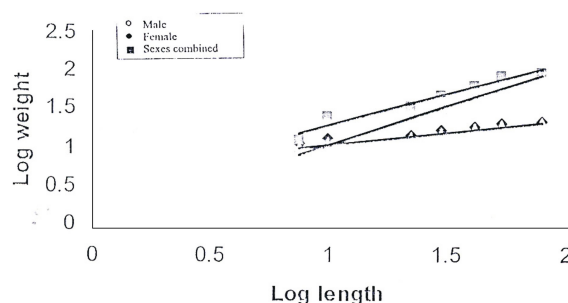
Fig. 2. Plot of values of logarithmic length-weight relationship of male, female and sexes combined of Cirrhinus reba from Manchar Lake, district Dadu, Sindh.